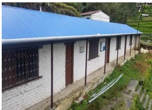
The new roof.

The kindergarten classrooms were also fitted out with carpet. Previously the children sat on the stone floor.