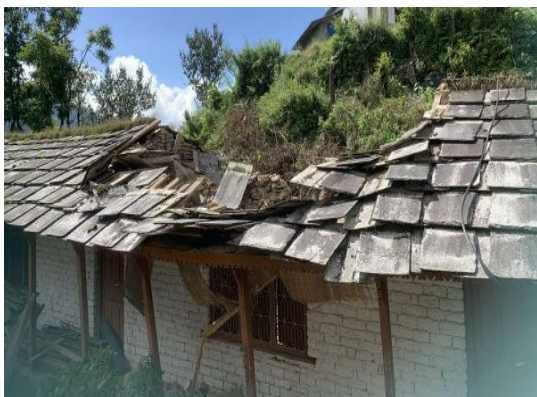
The collapsed slate roof over the classrooms in Ghandruk school.