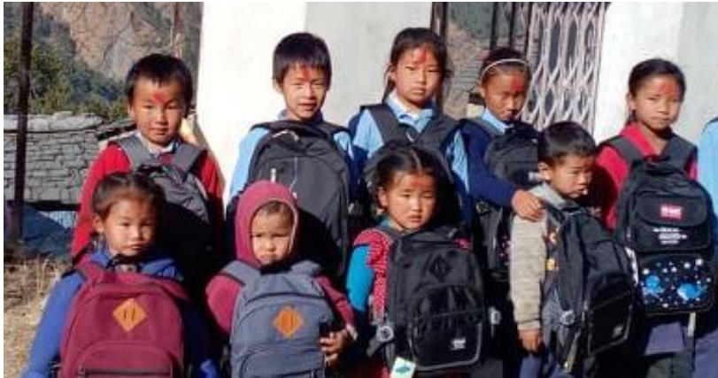
Photo: Dosalle primary school children