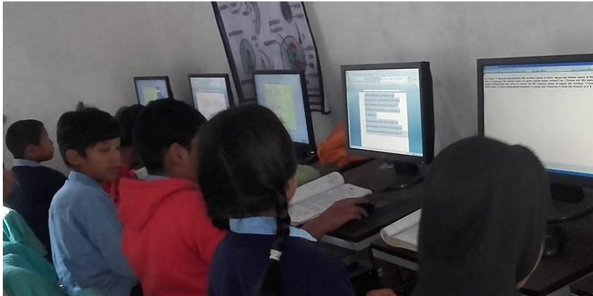
Photo: The charity pays for internet connection to the school