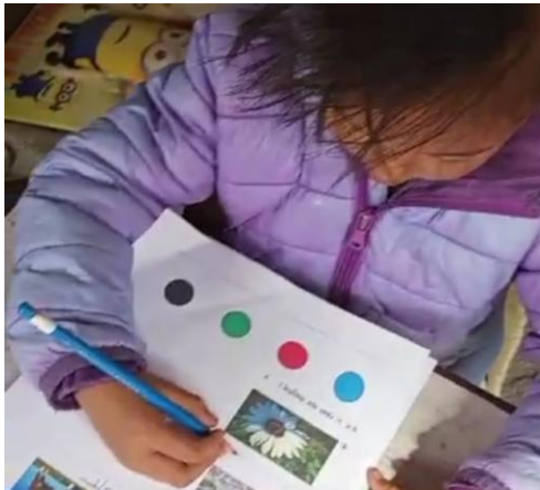
Early Years teaching remains a strong focus and, responding to a request from our representatives in Nepal, we agreed to supplement the relatively low salary of the teacher.

Responding to requests, we aim to fund in 2026: Teachers' salaries, training, school supplies and meals.