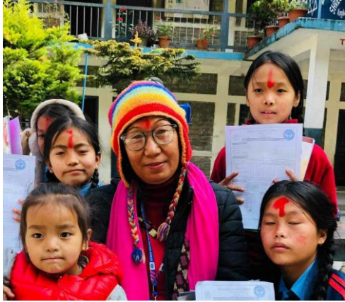
Children at the school in Tiplyang show their exam results.